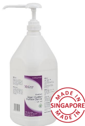
2.5 litres bottle

Packaging: 4 x 2.5 litres / carton Product Code: CDP4488-2.5LT