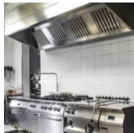
Kitchen & food outlets