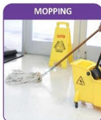
Mop / swab and rinse clean or allow to air dry.

Dilute before use: Dispense 2 to 3 pumps of EcoKleen Surface Cleaner into half a bucket of water (5 Litres).