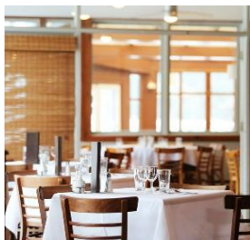
Tables & chairs