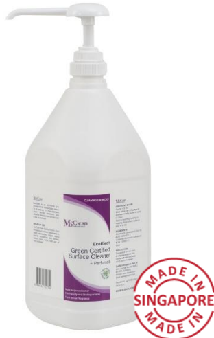
2.5 litres bottle

Packaging: 2 x 2.5 litres / carton Product Code: CDP4188-2.5LT