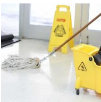
Mopping / General Cleaning