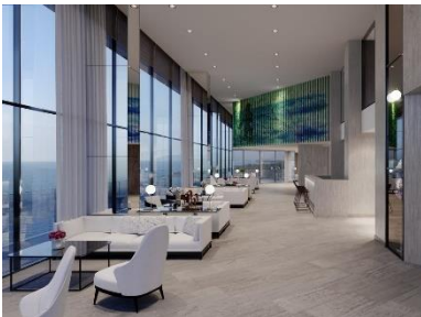
Hotels & resorts