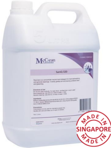
5 litres bottle

Packaging: 4 x 5 litres / carton Product Code: CDP8206-5LT