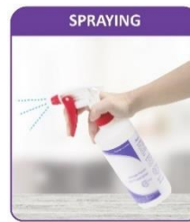
Spray on and rinse clean.