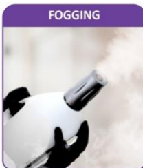
Apply by fogging equipment and air dry.

This product is to be used for intended purpose only. Handle with care and keep out of reach of children.