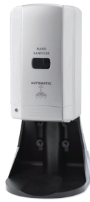
Dispenser Table Stand