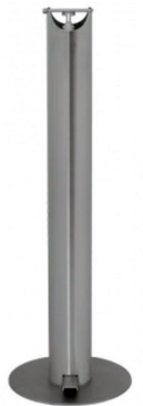
Hand Sanitizing Station