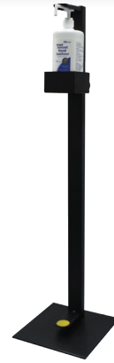
Hand Sanitizing Station