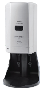
Dispenser Table Stand