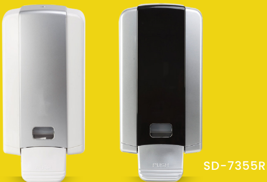
NuTech Liquid Soap Dispenser

Material: Acrylonitrile Butadiene Styrene Plastic (ABS)