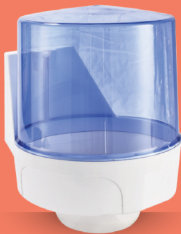
Centre Pull Paper Towel Dispenser MPD431